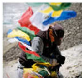
Buddhist Prayer flags