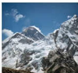
View of Everest

We are proud that LamSar is our sponsor once again. Their community support is outstanding! Many levels of corporate sponsorships are available. Please contact Bill at 519-336-0460 ext. 306 to discuss these fabulous and rewarding opportunities.